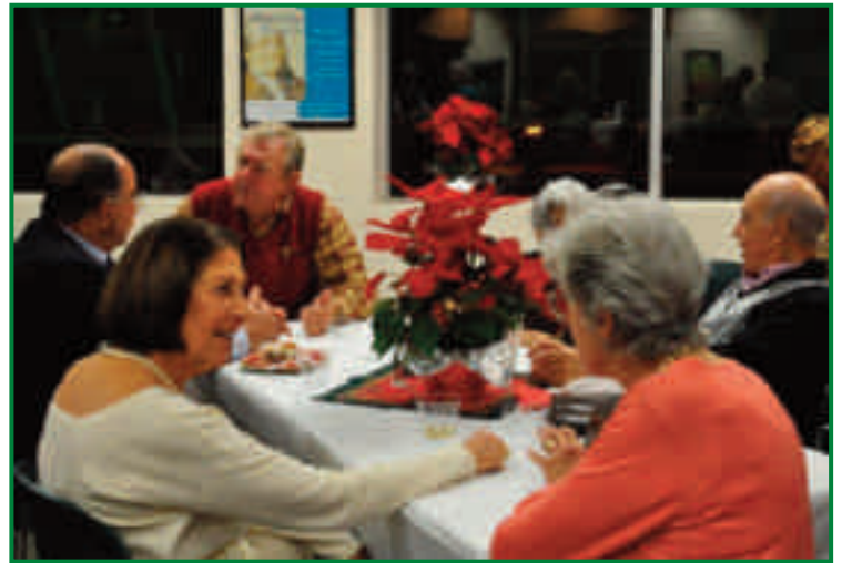
Holiday dinner for our hardworking volunteers.